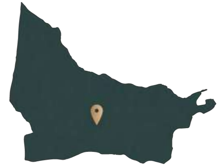
📍 Teoma Green Hills