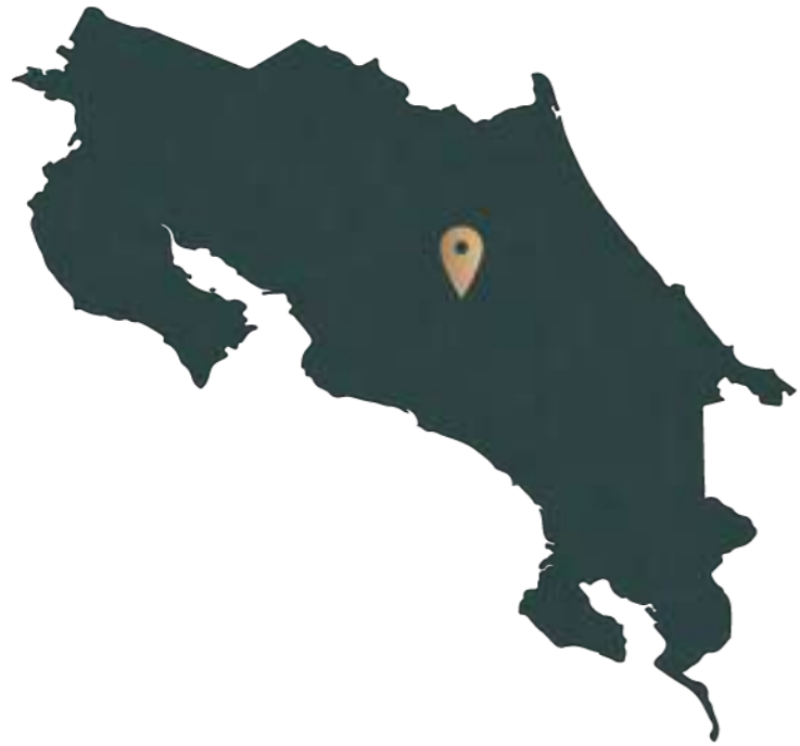
📍 Costa Rica